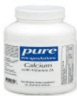
Calcium with Vitamin D3

Please see below for our full range of Vitamin D products - for more details of each product, or to order, please click on the links below.